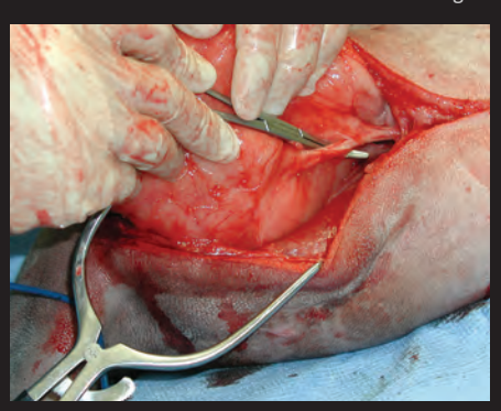
Fig 4: Intra-operative image of lipoma removal from the caudal thigh. Note the sciatic nerve coursing through the parenchyma of the mass